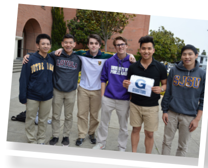
Class of 2017 Scholars

*Students received Presidential Scholarships from these institutions