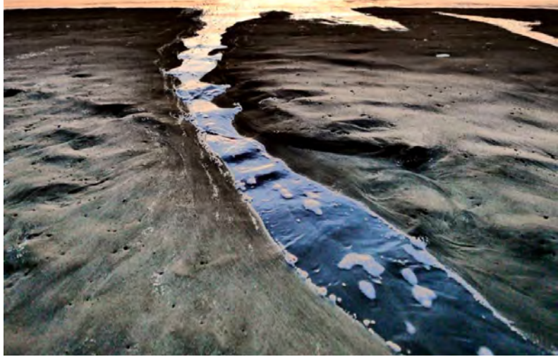
Ocean Beach, November 2016