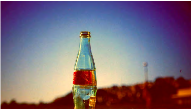
Dorm Room Window View