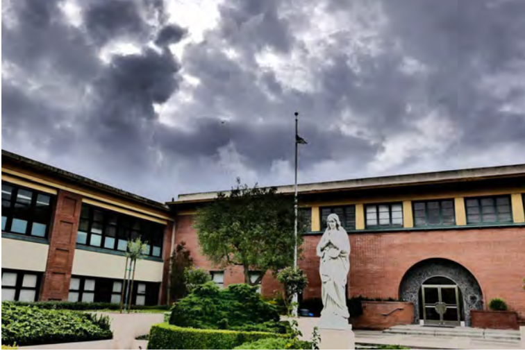
Gloomy Day at Archbishop Riordan High School