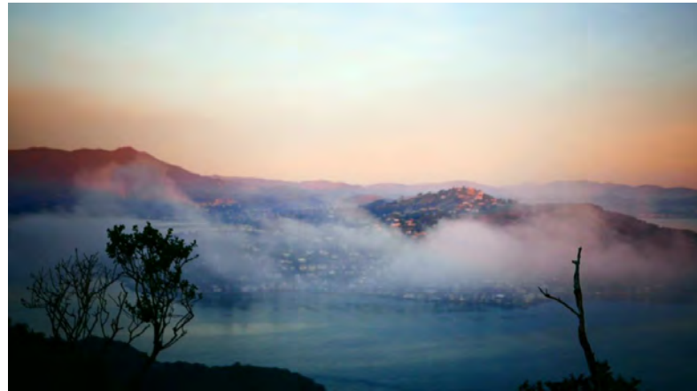
View From Angel Island, December 2016