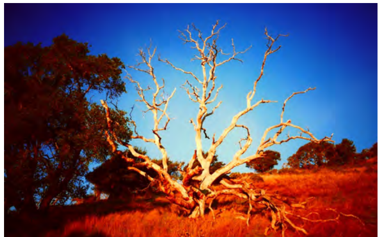
Angel Island Hike, December 2016